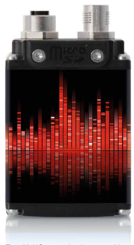
The MultiCore technology combines five high-performance processors with a novel software concept and maximizes the performance of weQube: It enables ideal interaction of the numerous functions and summarizing several process steps.