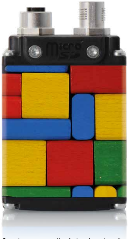
Convince yourself of the functionality and intuitive usability of an all-rounder like weQube.