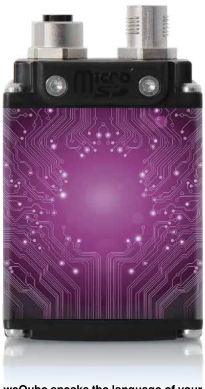
weQube speaks the language of your industry and does not only deliver valuable information, but makes it usable for the entire system.